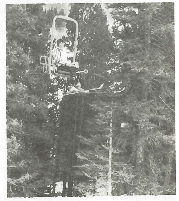
"I LIKE TO SIT BY MYSELF AND CONCENTRATE BEFORE THE RACE.

"I like to sit by myself and concentrate. I try to memorize the course, think about getting a good start and remember where the gates are after the jump. I try not to think about my competition. I just go up there and run my own race the best I can. When you start worrying about things, that's when you mess up."