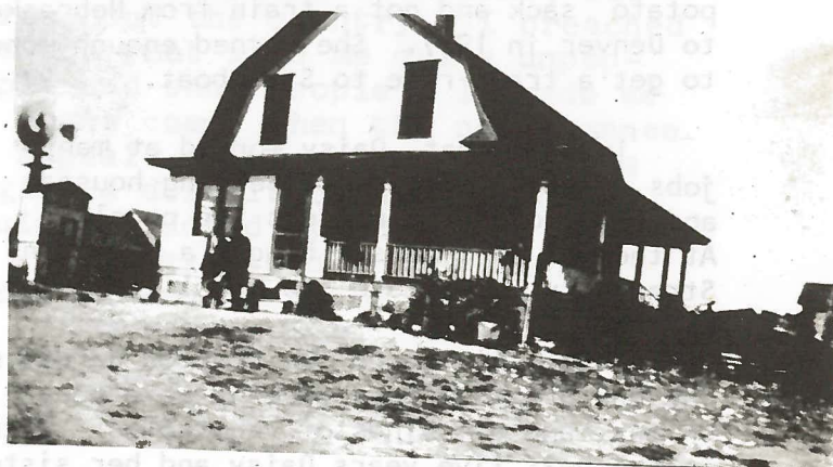
Front view of our ranch house.